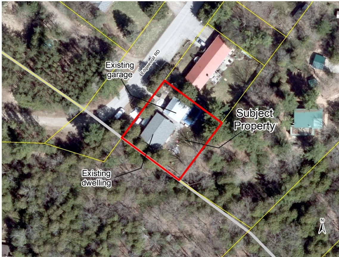
Figure 1 - Subject property

Our discussion of this application relative to the four tests under the Planning Act is as follows: